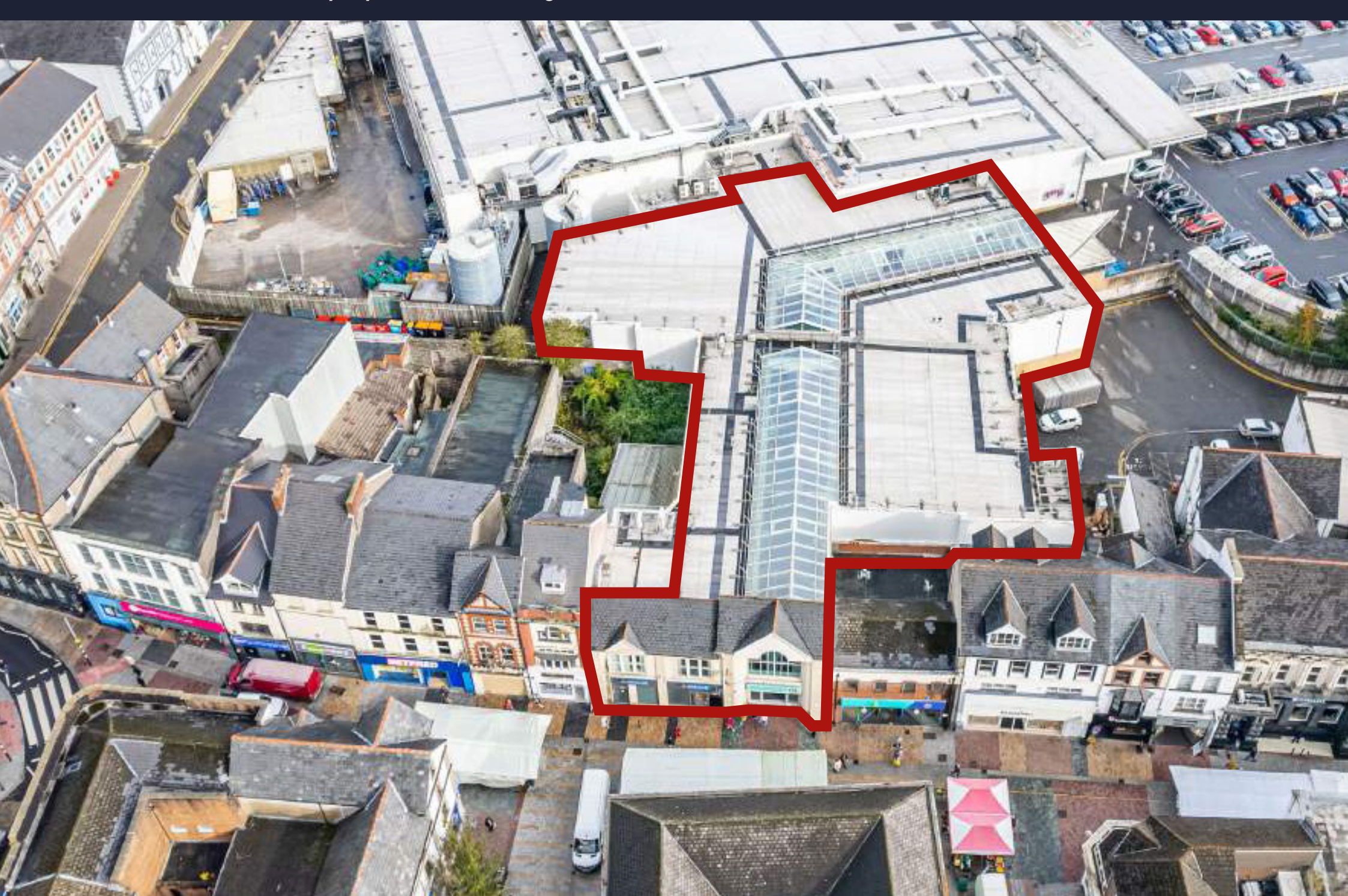
Unit 2, Beacons Place, Merthyr Tydfil, Mid Glamorgan, CF47 8DF